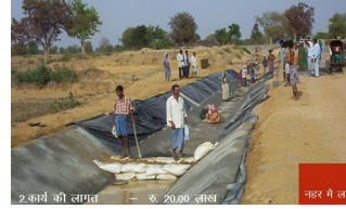
Works in progress under NREGAS